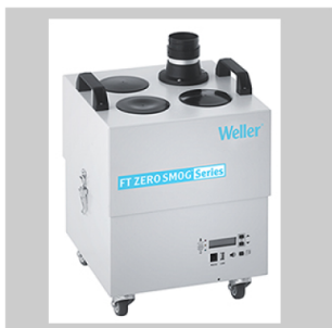
Solder fume extractors