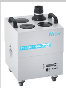
Solder fume extractors