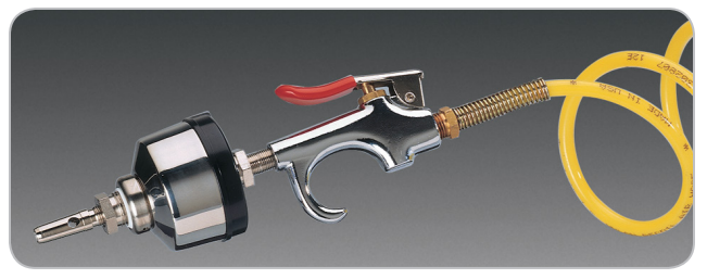
Optional gun/hose kit (p/n 91-6150).