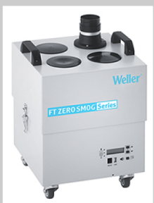
Solder fume extractors