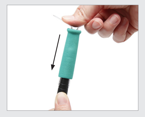
2. Insert the grip with the tabs onto the handle.