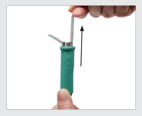
3. To remove the tabs, hold the grip and pull.