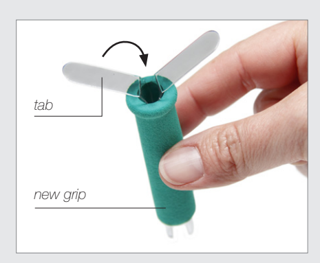
1. Put the slip-on tabs into the new grip.

Easy grip replacement (Ref. 0016057. Supplied in boxes of 4 grips) With these special slip-on tabs you can easy replace the damaged grip as follows: