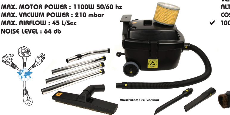
Illustrated : TE version

MAX. MOTOR POWER : 1100W 50/60 Hz MAX. VACUUM POWER : 210 mbar MAX. AIRFLOW : 45 L/Sec NOISE LEVEL : 64 db