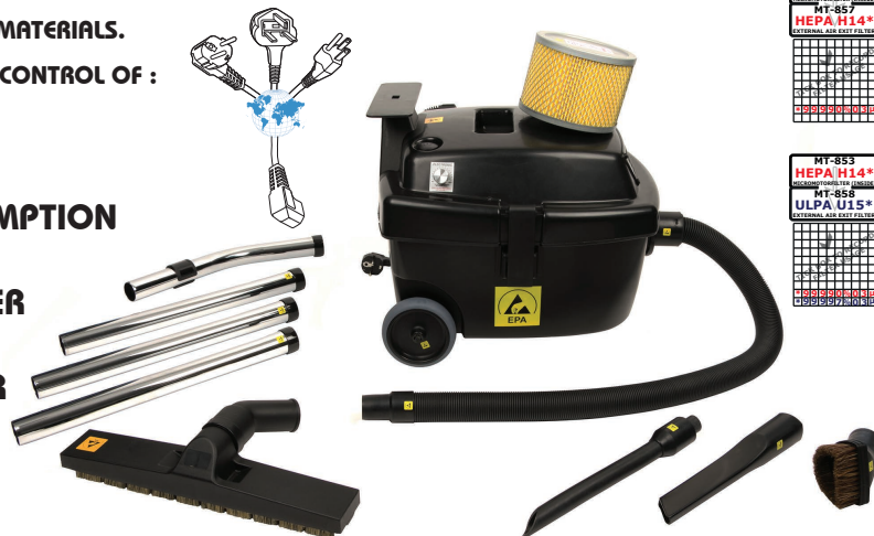
Illustrated : TE version

MEASUREMENTS : 39 x 34 x 42,5 CM (LxWxH). WEIGHT : 6 KG (APPLIANCE)