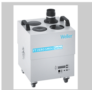
Solder fume extractors