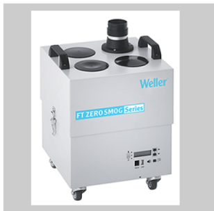
Solder fume extractors