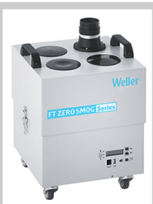
Solder fume extractors