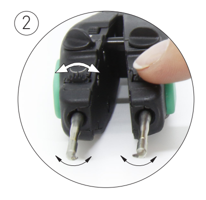
Rotational alignment Turn the cartridges in any direction through the wheels.