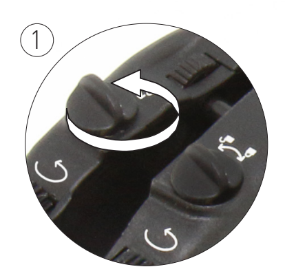
Locking Manual fixing without any tool.